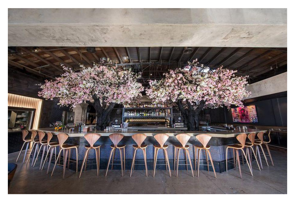
Cloak & Petal

Vibes are at a premium in these 10 establishments