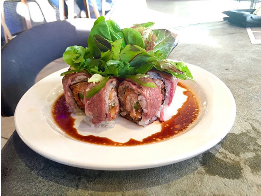
Wagyu roll

Most, if not all, consumers who patronize Cloak & Petal probably aren't. The demographic on this weeknight visit — and I'm guessing all others and weekends as well — was mainly millennials on a quest for the latest and greatest restaurants in a neighborhood that has become the hottest destination for new hospitality establishments, after the Gaslamp Quarter.