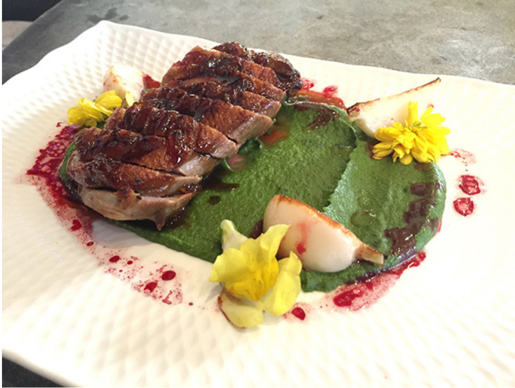
Glazed duck breast in edamame puree

We couldn't resist the former, which yielded an accordion arrangement of thick-sliced Canadian duck breast bedded in a pool of edamame puree and a little beet oil. Served with roasted turnips, it qualifies as the best meal that could ever land on your table for a holiday, should anyone in your household possess the talent for conjuring it up.