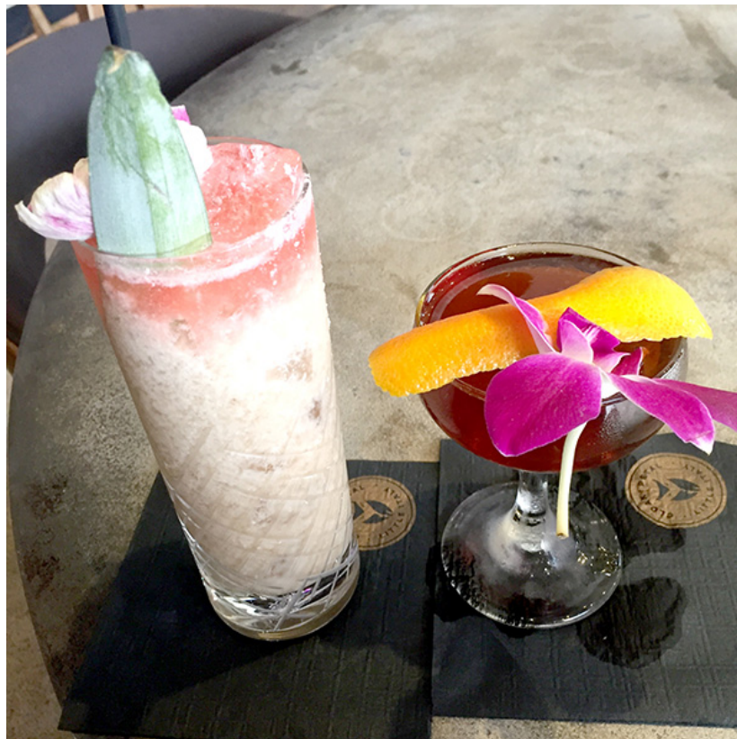
(l to r) The “devil’s advocate” and “Japanese to English” cocktails

We kicked off our visit with a couple of well-engineered libations: the Manhattan-like “Japanese to English” cocktail made with sesame-infused whiskey; and the “devil’s advocate,” which lured me with its blend of cashew milk and Caribbean rum. Both drinks seemed tailor-made for people like us who typically prefer wine over cocktails. They had the finesse and complexity of fine vino.